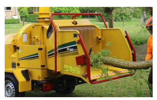
MARKET-LEADING INFEED. A large infeed opening of 203x305 mm in combination with a wide tapered infeed table provides the capacity to do the hard work for you.