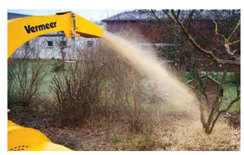
NO-COMPROMISE CHIPPING. Coupling the Kubota 48,1 hp (35,9 kW) engine to a 76 cm diameter 4-knife disc, the BC190xL can handle diametres up to 20 cm and discharges chips at an average distance from 10 to 12 metres - all this at 120 dB(A)!