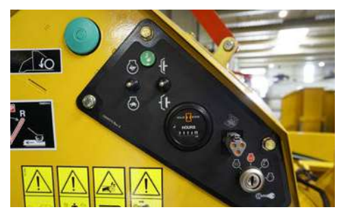
PUSH-BUTTON CHIPPING. Convenient operation with one switch to engage the throttle and one switch to engage the cutter disc, with indicator light.