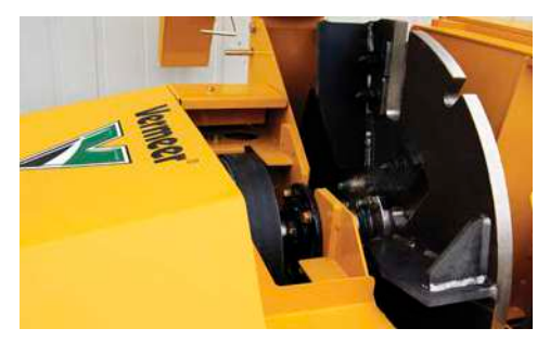
BUILT TO LAST. Market-leading oversized cutter bearings, disc, drive and infeed system mounted in a high-strength all-steel body to provide the productivity needed for your demanding workloads.