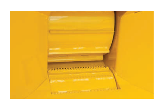
LARGEST INFEED ROLLERS IN CLASS. With an offset 400 mm top roller and 260 mm bottom roller combined with Vermeer-exclusive auto reversing SmartFeed control, feeding material becomes much more convenient.